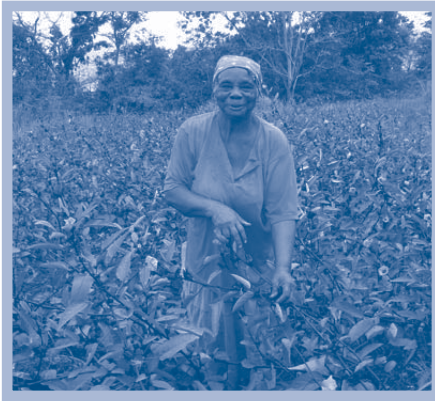
A woman farmer of STWAI tending to their Sorrel crops.

By the end of 2007, an estimated 230,000 people were living with HIV/AIDS in the region. MATCH partners