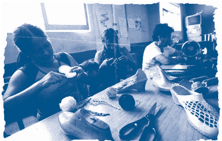
La Voz residents learning occupational skills making shoes.

La Voz de la Mujer is a shelter in Peru, which has had a longstanding relationship with MATCH. Over the last three years 378 women and 776 children, and some independent girl victims of abuse have been received at the shelter, given accommodation, food and medicines and provided with legal counsel. To strengthen the women's economic futures the shelter provides basic business and marketing skills and practical training in shoe and towel making. La Voz has been the catalyst in organizing a national network of women's shelters in Peru and of establishing new shelters outside Lima.