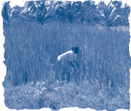
Sri Lankan women harvesting and producing products for sale at local market.

The money raised at “Arts Affair” was immediately directed by MATCH to a dynamic team of grassroots women in Sri Lanka whose innovation is increasing