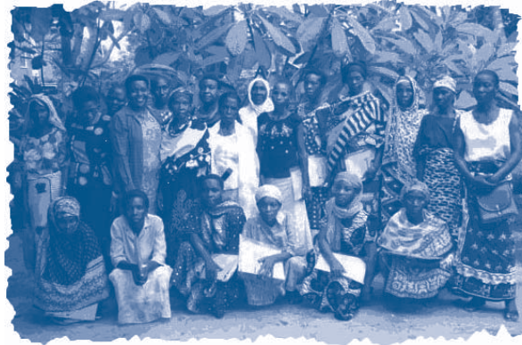
TWCWC group picture of women in Toangoma Ward.

There is no ‘legal aid’ in Tanzania. Support of any kind is nominal. MATCH and our partner, the TWCWC (Tanzanian Women and Children Welfare Centre), are working to increase women’s access to legal literacy training, free legal aid service, and legal counseling.