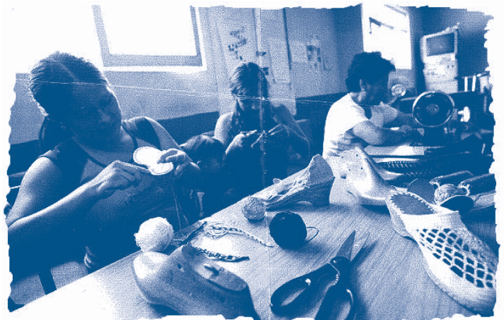
La Voz residents learning occupational skills making shoes.

La Voz de la Mujer is a shelter in Peru, which has had a longstanding relationship with MATCH. Over the last three years 378 women and 776 children, and some independent girl victims of abuse have been received at the shelter, given accommodation, food and medicines and provided with legal counsel. To strengthen the women's economic futures the shelter provides basic business and marketing skills and practical training in shoe and towel making. La Voz has been the catalyst in organizing a national network of women's shelters in Peru and of establishing new shelters outside Lima.