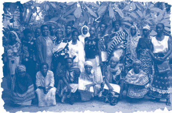
TWCWC group picture of women in Toangoma Ward.

There is no ‘legal aid’ in Tanzania. Support of any kind is nominal. MATCH and our partner, the TWCWC (Tanzanian Women and Children Welfare Centre), are working to increase women’s access to legal literacy training, free legal aid service, and legal counseling.